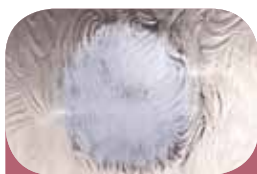
Privacy Level 3