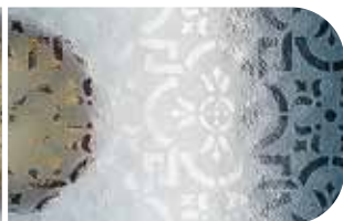
Pilkington Oriel Texture Canterbury™