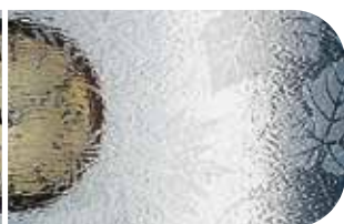
Pilkington Oriel Texture Coppice™