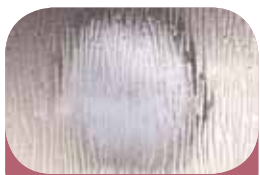
Privacy Level 4