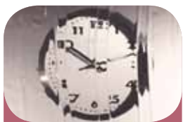
Privacy Level 1