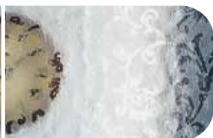
Pilkington Oriel Texture Brocade™