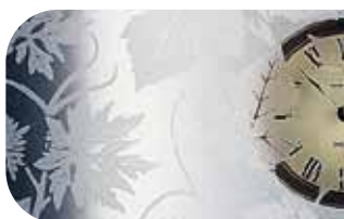
Pilkington Oriel Coppice™

With a superb range of designs, together with diffused glass options for each design, this premium range of etched glass adds a touch of style and elegance to your home.