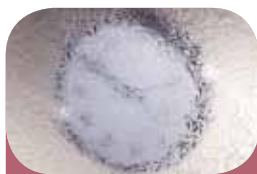
Privacy Level 2