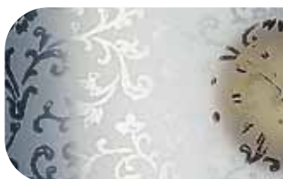
Pilkington Oriel Brocade™