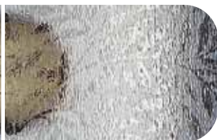
Pilkington Oriel Texture Laurel™