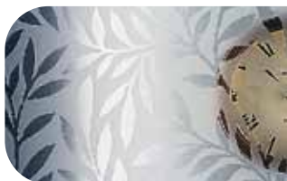
Pilkington Oriel Laurel™