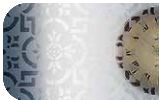
Pilkington Oriel Canterbury™