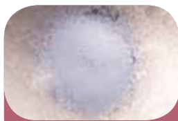
Privacy Level 5